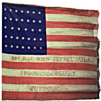
25th New Jersey Infantry Battle Flag