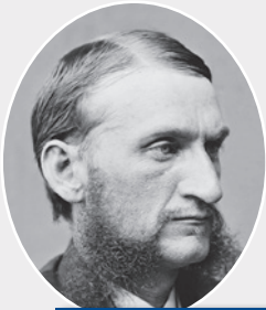
Brigadier General Judson Hugh Kilpatrick