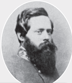
Brigadier General Fitzhugh Lee