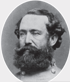
Brigadier General Wade Hampton