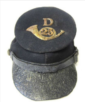
25th New Jersey Infantry Kepi

The regiment was ordered to charge the wall at Marye's Heights where the brigade under Colonel Rush Hawkins was cut down in great numbers like the rest of the Union troops. All the Union forces that moved against the wall met with the same disastrous results. The numerous charges ordered by General Burnside against a well defended 4 foot stone wall ranks as one of the most foolhardy acts of the Civil War.