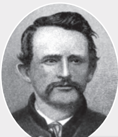
Brigadier General Elon John Farnsworth