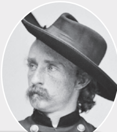
Brigadier General George Armstrong Custer