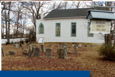
Old Methodist Church and Cemetery on Evesham Avenue