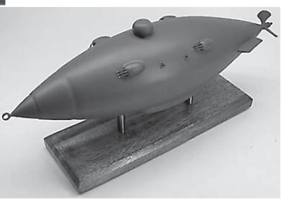
Model of the Intelligent Whale.