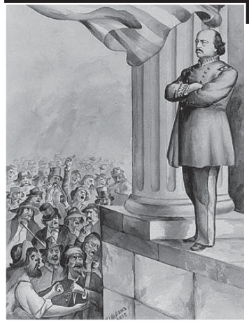
Butler holding back the crowd in New Orleans