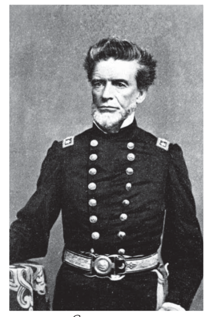
Govenor Thomas Overton Moore

brothers, and husbands shall constitute a justification to a brutal soldiery for the indulgence of their lust. The commanding general, from his headquarters, announces to his insolent followers that they are at liberty to treat as women of the town the wives, the mothers, the daughters of our citizens, if by word, gesture, or movement any contempt is indicated for their persons or insult offered to their presence. Of the nature of the movement and the meaning of the look these vagabond refuse of the Northern States are to be the judges.