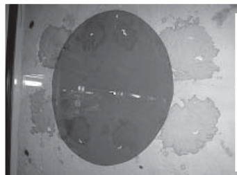
The flag carried by a Japanese soldier on Iwo Jima. A closer view of the flag showing the bullet holes and blood stains.