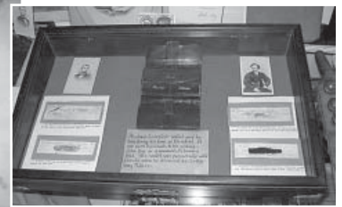
President Abraham Lincoln's wallet