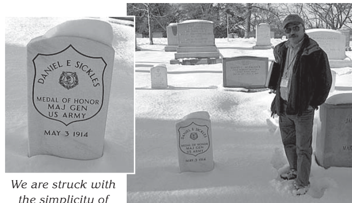
We are struck with the simplicity of this headstone.