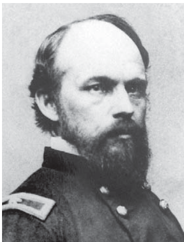
Brigadier General George J. Stannard (Wounded)