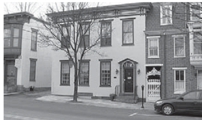
The Gettysburg Museum of History is located in the light-colored structure at 219 Baltimore Street