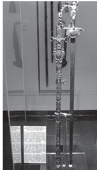
Sword given to Lt. General Ulysses S. Grant from the people of Kentucky

showcase the Naval, Medical and Musical instruments of the War. Artifacts include uniforms, firearms, knives, belts, corps badges, swords, projectiles, saddles, and an Underwater Keg Mine (Confederate Torpedo).