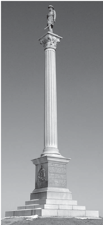
2nd Vermont Brigade Monument, Gettysburg

The men of the 2nd Vermont Brigade, a nine month unit, were called paper-collar soldiers having spent eight and one-half months of their nine month careers in the forts south of Washington. Here they guarded the Orange and Alexander railroad, tangled with the "Grey Ghost" of the Confederacy, General Mosby who to everyone's embarrassment captures their commanding general in bed. They might have faded into history, unknown, but for their heroic performance at the Battle of Gettysburg. Come view hundreds of Civil War songs and sounds as they fire into the flanks of Pickett's Charge on July 3, 1863 and become "Gettysburg Heroes".