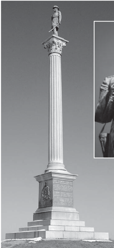
2nd Vermont Brigade Monument, Gettysburg

first flanking Pickett's division by wheeling two units to the