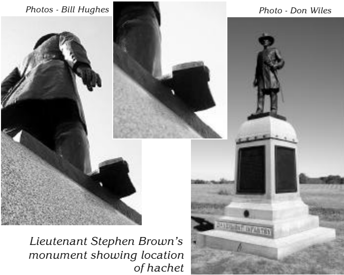
Lieutenant Stephen Brown's monument showing location of hatchet