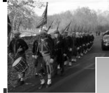
Remembrance Illumination National Cemetery