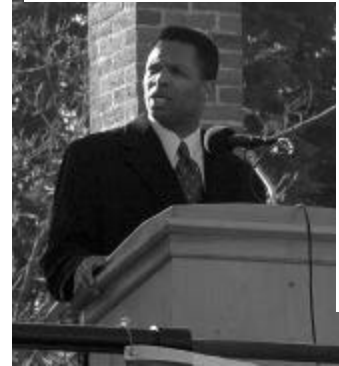
Dedication Day Speaker Jesse Jackson Jr., US Representative, Illinois