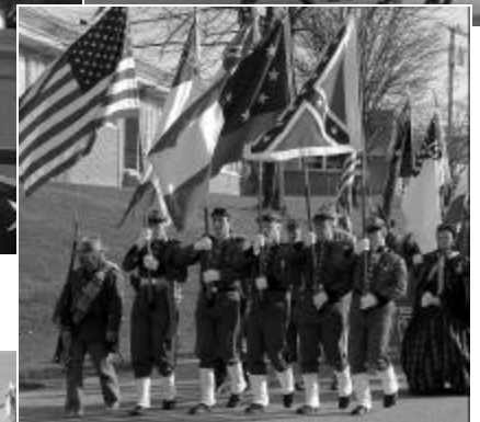
CSA Regiments in Dedication Parade