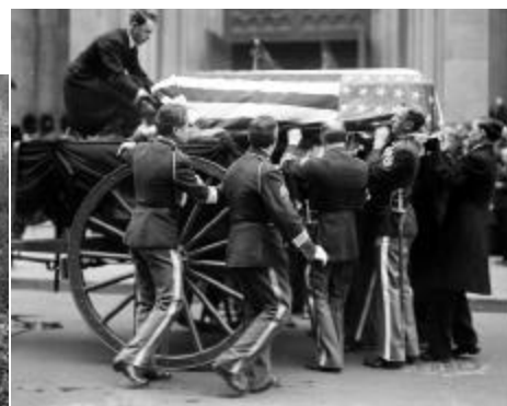
Scene from Sickles' Funeral