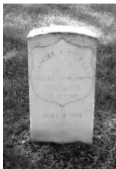
Sickles Grave Arlington Cemetery

In 1998 the tourism in Gettysburg-Adams County contributed $275 million to the economic impact of Pennsylvania which included a state sales tax and will eventually, a "pillow tax."