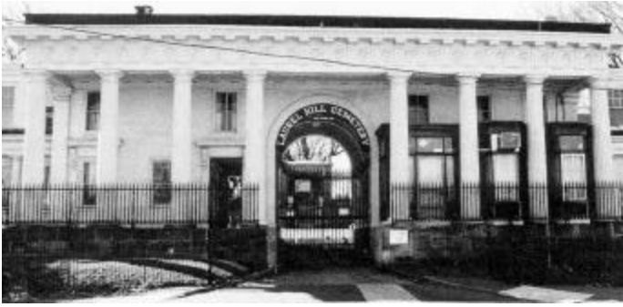
Laurel Hill Gatehouse