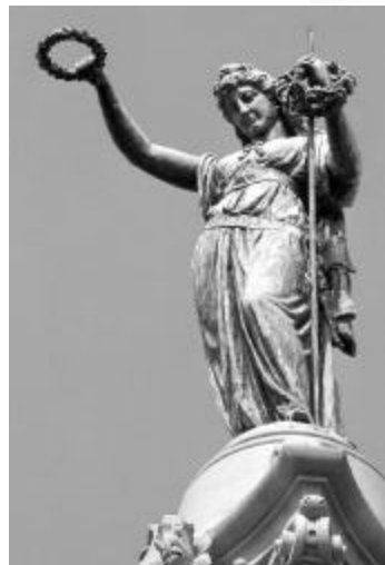
Top of New York Monument... She is sheading tears for her fallen sons.