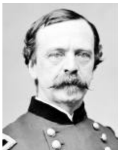
Major General Daniel Sickles