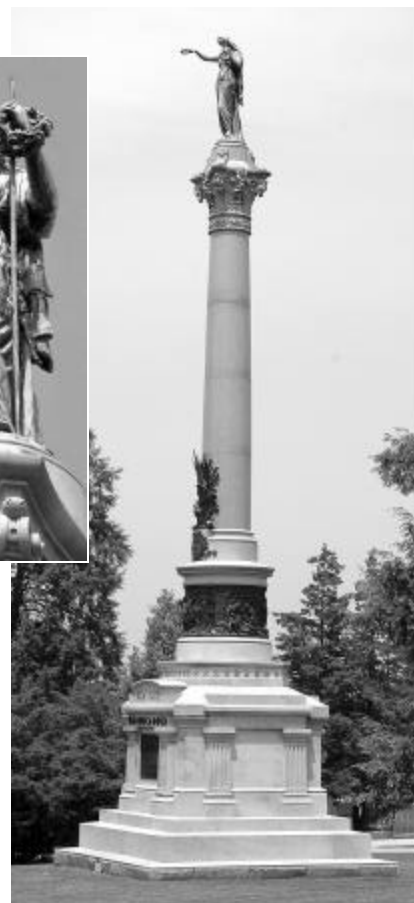
The New York Monument in the Soldiers National Cemetery, Gettysburg

Every year, New Yorkers have been Gettysburg's most frequent "tourist" according to the 1998 survey and "contributed" these taxes to the state of Pennsylvania and not to the Gettysburg National Military Park or the Gettysburg National Cemetery.