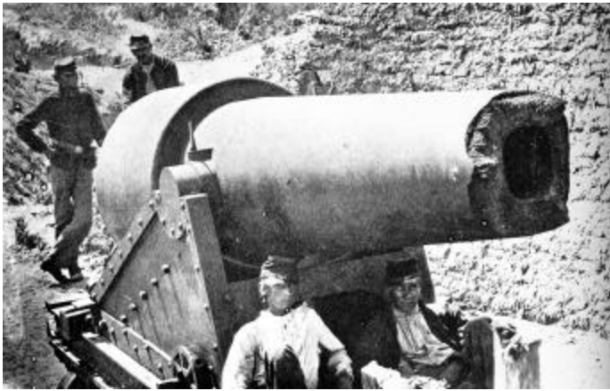
Yankee troops occupying Morris Island and showing the damage to a 300 pound Parrott