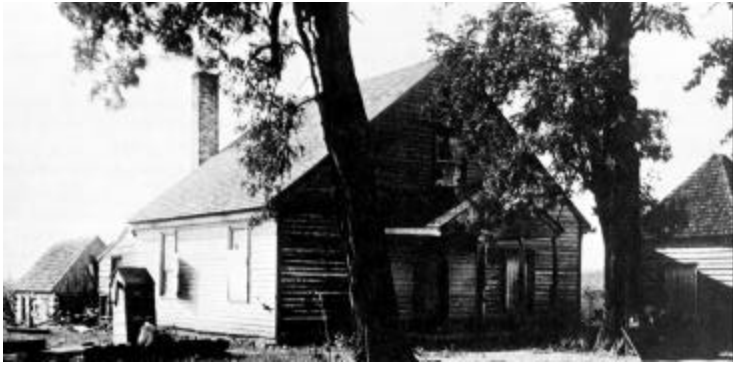
Guiney's Station where Jackson said these words

although he owned most of Scott's books, studied them carefully, and learned a great deal from them.