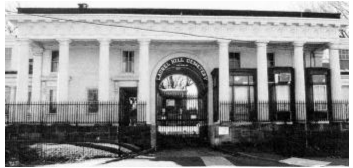
Laurel Hill Gatehouse

Hill but there is also over twenty other Union generals interred there. Also of note is the burial site of Confederate Lieutenant General John C. Pemberton who surrendered Vicksburg to Union general U. S. Grant on July 4, 1863. Many other Philadelphia notables are interred in one of the most beautiful and historic cemeteries in the country.