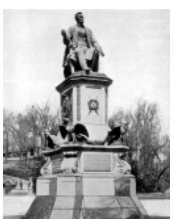
Abraham Lincoln, at Lemon Hill, Fairmount Park

Philadelphia in the Civil War 1861 - 1865 Published 1913