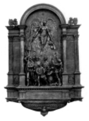
Bronze tablet in honor of the "Union League Regiments", at Union League club house