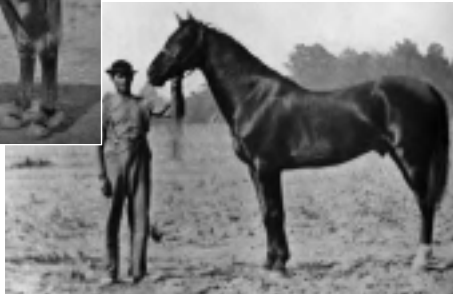
One of Grant's Horses "Egypt"