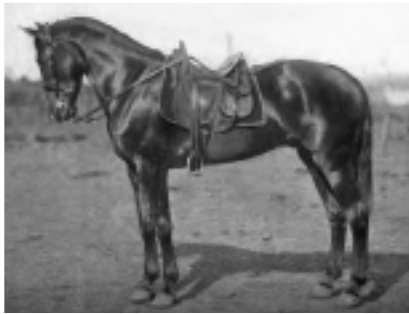
Typical Officer's Mount